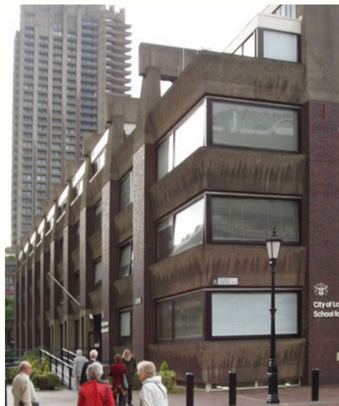
City of London Girls School