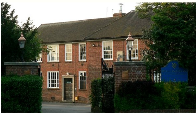
Wallington Grammar for boys