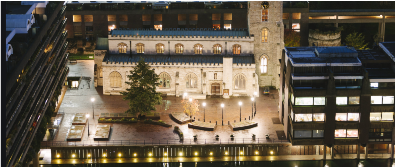
City of London School for Girls.